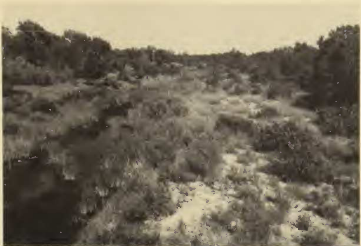
FIG. 11.—Wolf Creek just north of Lipscomb, Lipscomb County.